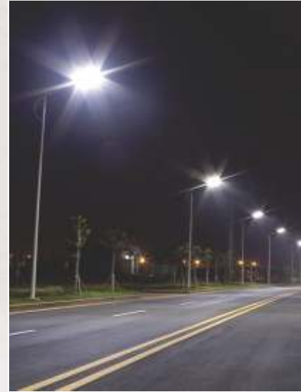
STREET LIGHTS & OVERHEAD LINES WITH TRANSFORMER