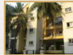
RAJA HELIX BILEKAHALLI, OFF BANNERGHATTA ROAD