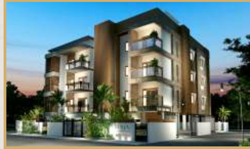
RAJA MELROSE YELAHANKA NEW TOWN