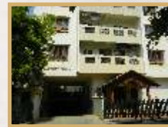
MEENAKSHI MANOR JAYANAGAR