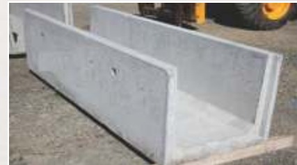
CONCRETE RAIN WATER DRAIN