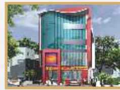
RAJA GLITZ DOUBLE ROAD