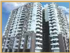
RAJA ARISTOS NEAR MEENAKSHIMALL/TEMPLE