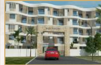
RAJA PLATINO OFF BANNERGHATTA ROAD