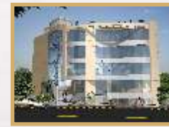
RAJA SUPRABHA JAYANAGAR 3RD BLOCK