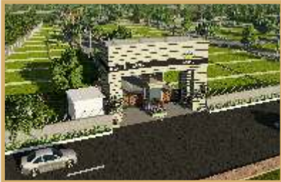
RAJA PRIME GARDEN BEHIND FUNFORT, MYSORE