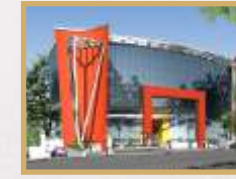
RAJA IKONA MARATHAHALLI (OPP TO MULTIPLEX THEATER)