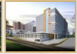
SJR PRIME CORP