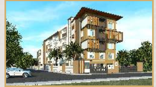
RAJA FOUR SQUARES KORAMANGALA, ADUGODI