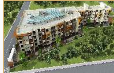
RAJA STANFORD OFF INTERNATIONAL AIRPORT ROAD