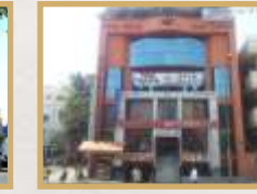
RAJA GALAXY 9TH BLOCK, EASTEND, JAYANAGAR