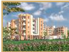
MEENAKSHI MANGALAM BANNERGHATTA ROAD