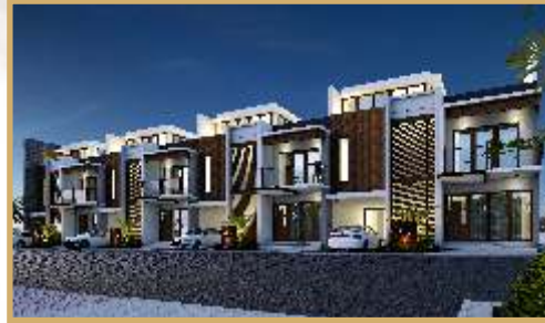
RAJA WOODS PARKK JP NAGAR, 9TH PHASE