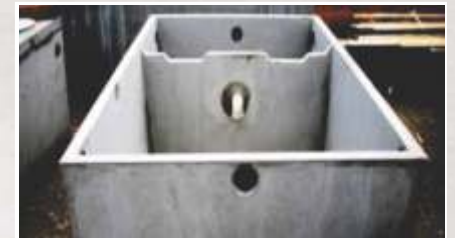
CONCEALED SOAK PIT FACILITY