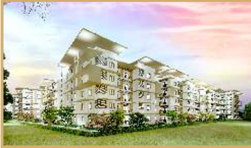
RAJA RITZ AVENUE HOODI CIRCLE, WHITEFIELD