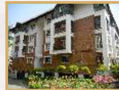
RAJA PRAKRUTHI JAYANAGAR