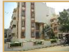
MEENAKSHI RESIDENCY BANNERGHATTA ROAD