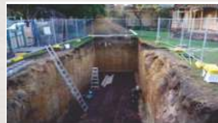
UNDERGROUND WATER SUMP