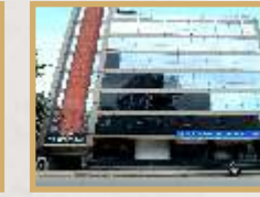
RAJA HARIHARAN TOWERS V.V.PURAM