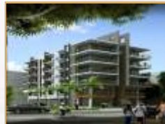
MEENAKSHI SAROVAR OPP. ULSOOR LAKE