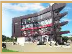
RAJA PLAZA NEAR MEENAKSHI MALL/TEMPLE