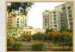
MEENAKSHI CLASSIC HSR LAYOUT